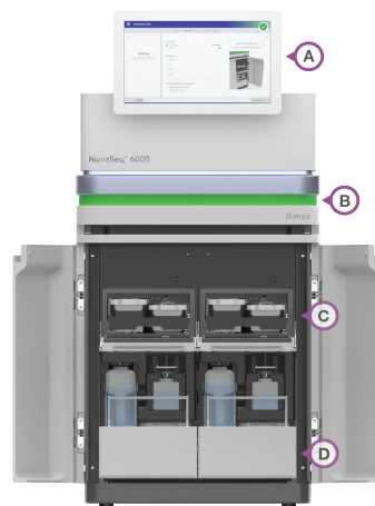
Figure 3: The NovaSeq 6000 System provides straightforward operation — Many features of the NovaSeq 6000 System are designed to simplify genomic studies, including (A) intuitive touch screen interface, (B) lighted LED display indicates flow cell status, (C) snap-in cartridges contain ready-to-use reagents, and (D) waste containers that can be easily removed for disposal.

and somatic variant calling. For other analysis options, including in-house pipelines, NovaSeq System Software generates base calls and quality scores in real time as per cycle base call (*.cbcl) files. The included bcl2fastq2 software translates *.cbcl files into FASTQ files for downstream analysis.