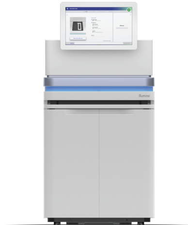
Figure 1: The NovaSeq 6000 System —Transforming sequencing by combining throughput, flexibility, and ease of use for virtually any method, genome, and scale.

The NovaSeq 6000 System offers output up to 6 Tb and 20 B reads in < 2 days. Multiple flow cell types and read length combinations offer flexible output and run time configurations based on project